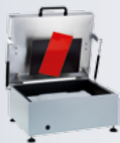
■ cliché cleaner