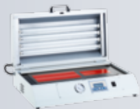
■ exposure unit

For optimal results, we recommend that you acquire the below presented set of equipment (Please ask about the data sheets):