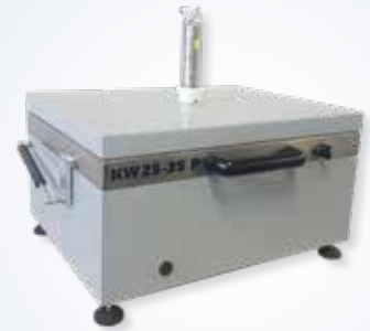
Figure shows pneumatic drive

With our clichee washer KW 25 x 35 and KW 25 x 35 P of Tampomark you can wash out alcohol or water based clichees evenly, comfortably and tidy.