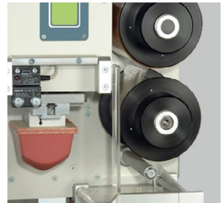
automatic pad cleaning

Scope of delivery: pad cleaning, ink-cup, cliché holder, foot switch