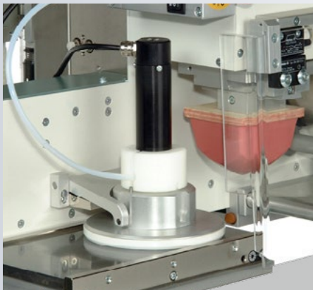
ink-cup with viscomat