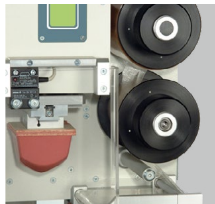
automatic pad cleaning

Scope of delivery: pad cleaning, ink-cup, cliché holder, foot switch