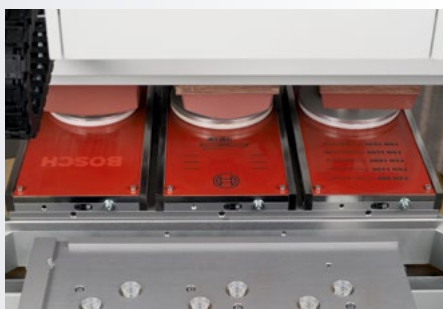
Different print images on cliché