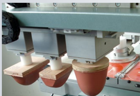
Optional pad shuttle for pad movement