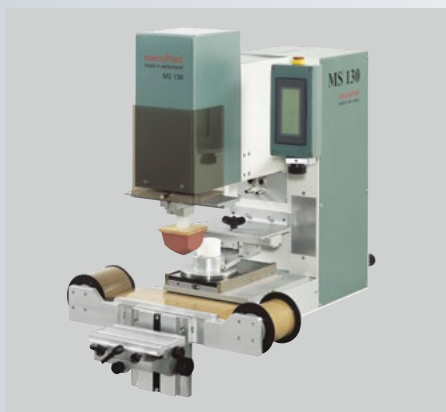
MS 130 als table model