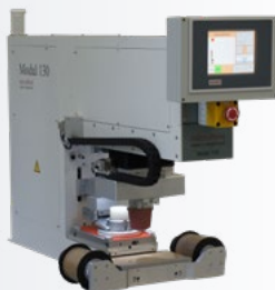
Modul 130 without optional security housing

Basic equipment includes: pad cleaning, ink cup, cliché holder, foot switch