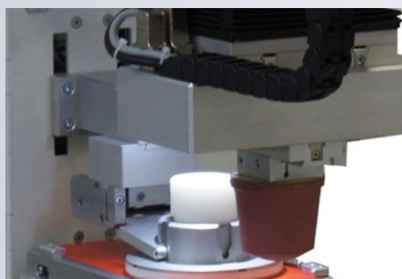
optional pad movement for lateral tampon movement