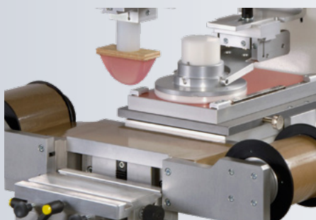
Fully automatic pad cleaning

Basic equipment includes: pad cleaning, ink cup, cliché holder, foot switch