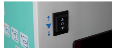
above: adjustment pad stroke below: interface