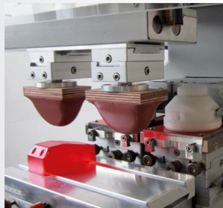
Ink-cup cross-table / pad shuttle