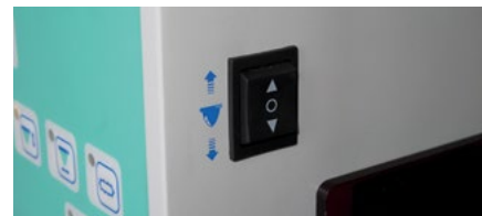
above: adjustment pad stroke below: interface