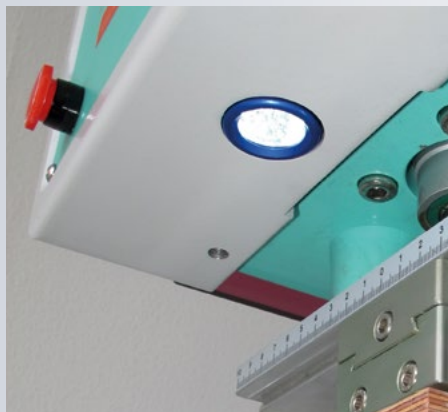
LED light for work area