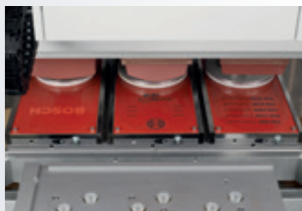
Different print images on cliché