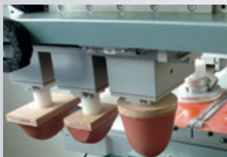
Optional pad shuttle for pad movement