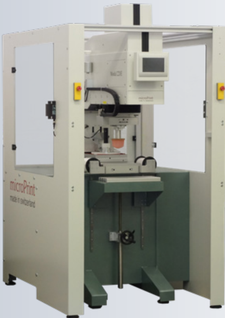
pic: shows optional security housing